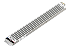
Enterprise and Data Center Small Form Factor (EDSFF)