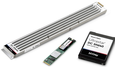
Western Digital Ultrastar DC SN640 NVMe SSDs for Data Centers